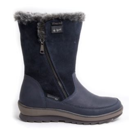
MISTT B6446 -Black Eco Nubuck/Cow Suede **200 Gram Thinsulate**