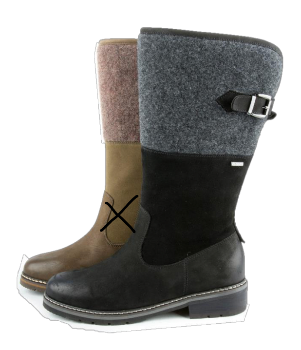
Venus B5766 Blk Nubuck/suede/Felt