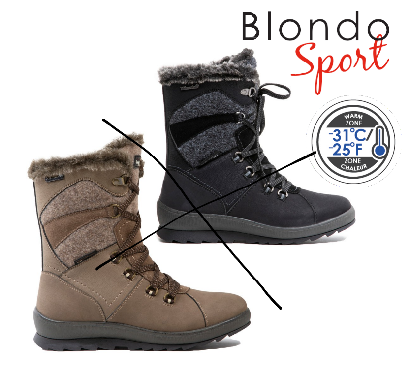
MAYRA B6951 200 gm Thinsulate* Inside Zipper*