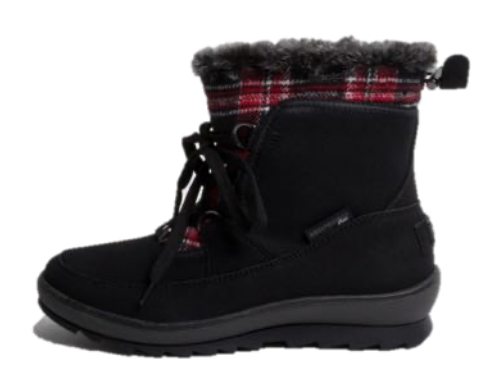
MIRACLEE B6508 -Black Eco Nubuck/Pebble Nubuck/Wool Plaid **200 Gram Thinsulate**