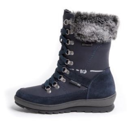
MAJESTI B6417 Black Cow Suede/Eco Nubuck/2 Tone Fur **200 Gram Thinsulate**